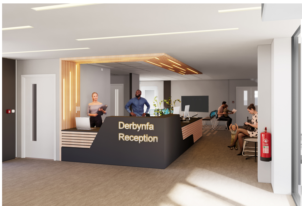
Fig 2. Main Reception Visual